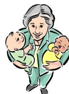
Hiring a Nursery Attendant

This golden opportunity can be yours...man or woman... this is your chance!