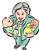
Hiring a Nursery Attendant